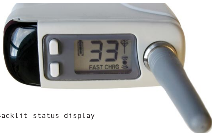
Backlit status display