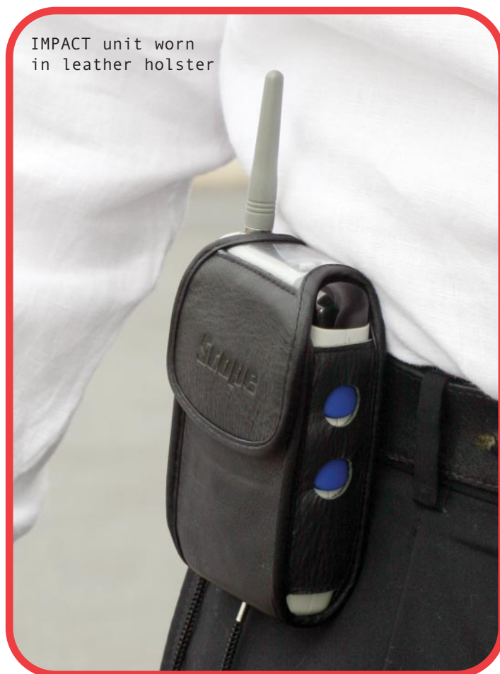
IMPACT unit worn in leather holster

Different pre-defined modes can be made available to the user, who can then select the Mode using the top mounted display and control buttons. For example, Mode 1 enables just the A & B buttons. Mode 2 enables the buttons & the accelerometer. This allows the basic functions of the unit to be re-programmed manually without the need for a PC. Alternatively, the unit can be pre-programmed to lock out user access, preventing any alteration to the set functions and parameters.